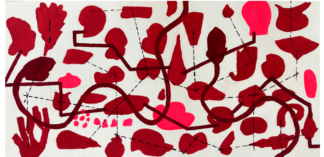
Collection 2021 12 x 24 acrylic on wood panel