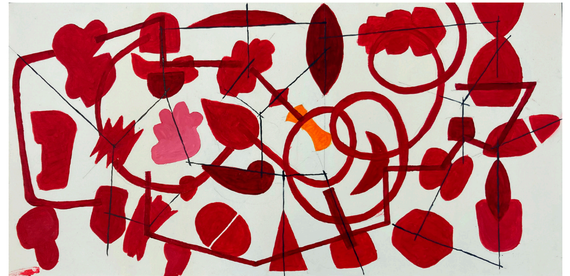
Accumulation 2021 12 x 24 acrylic on wood panel