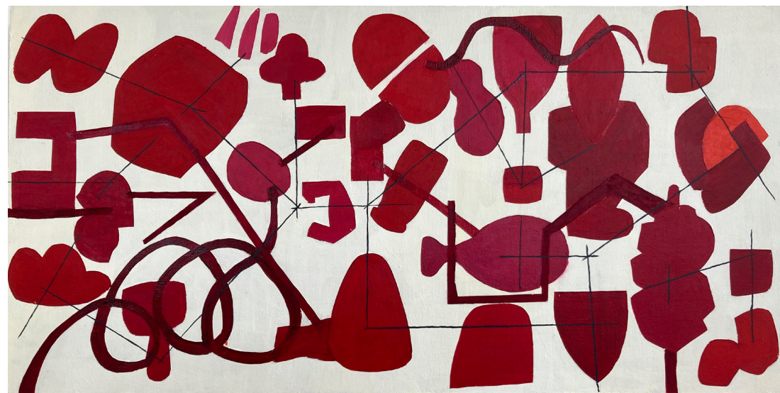
Addition 2021 12 x 24 acrylic on wood panel