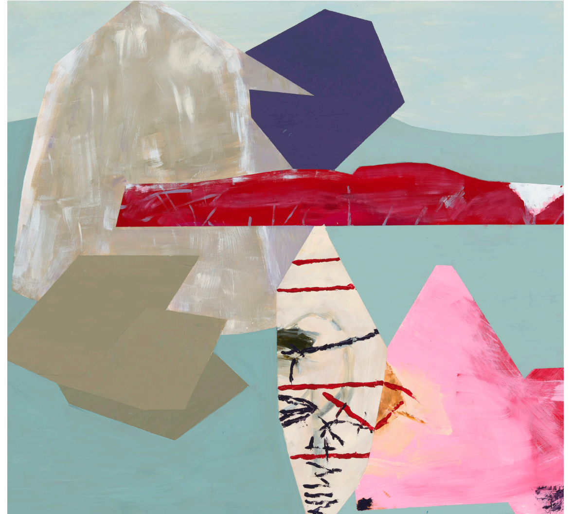
Fulcrum 2018 36 x 48 acrylic on wood panel