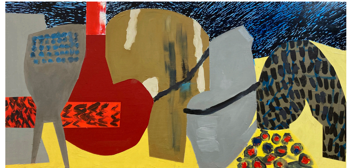
Insomniacs 2021 12 x 24 acrylic on wood panel