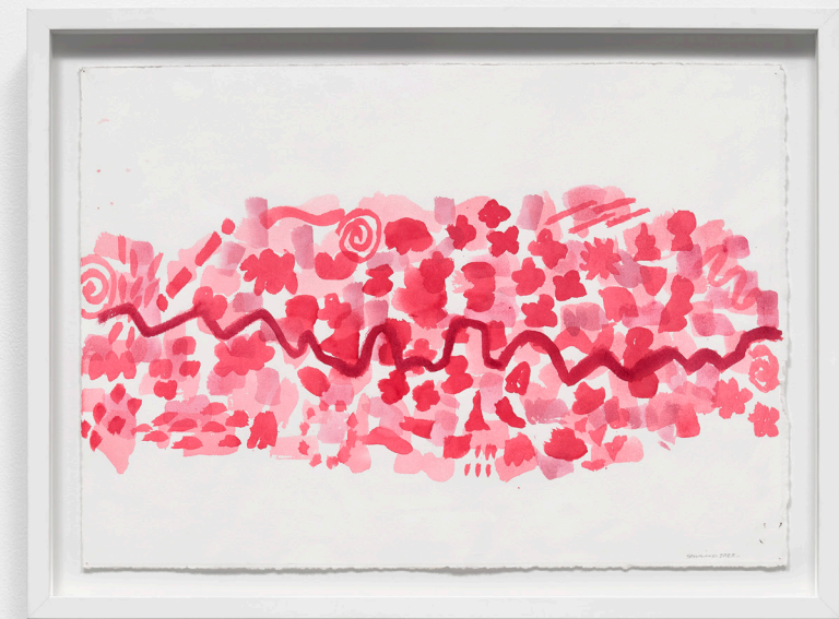
Meander 2 2022 18 x 24 watercolor on paper