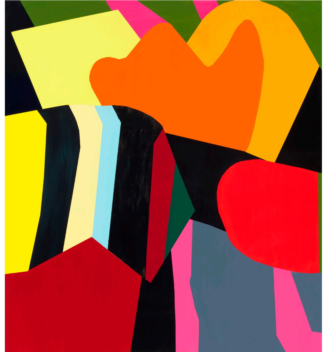
Shopping for Dresses 2018 40 x 36 acrylic on wood panel