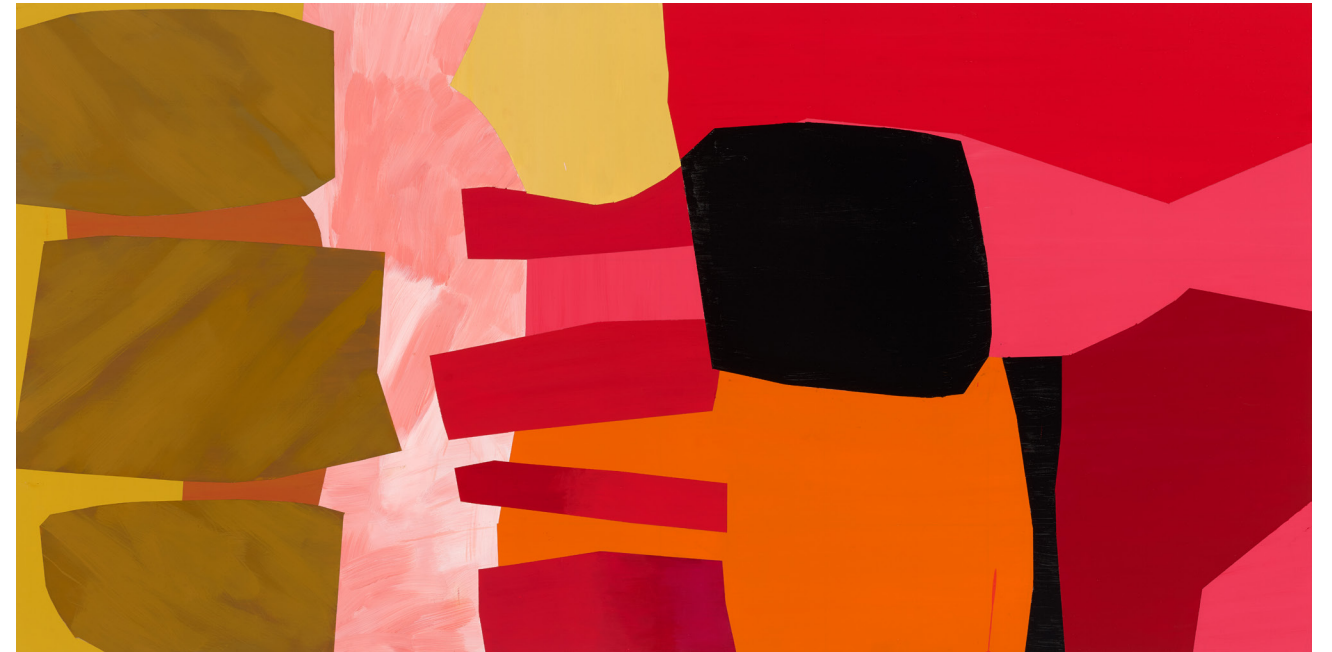
Cicatrice 2019 24 x 48 acrylic on wood panel