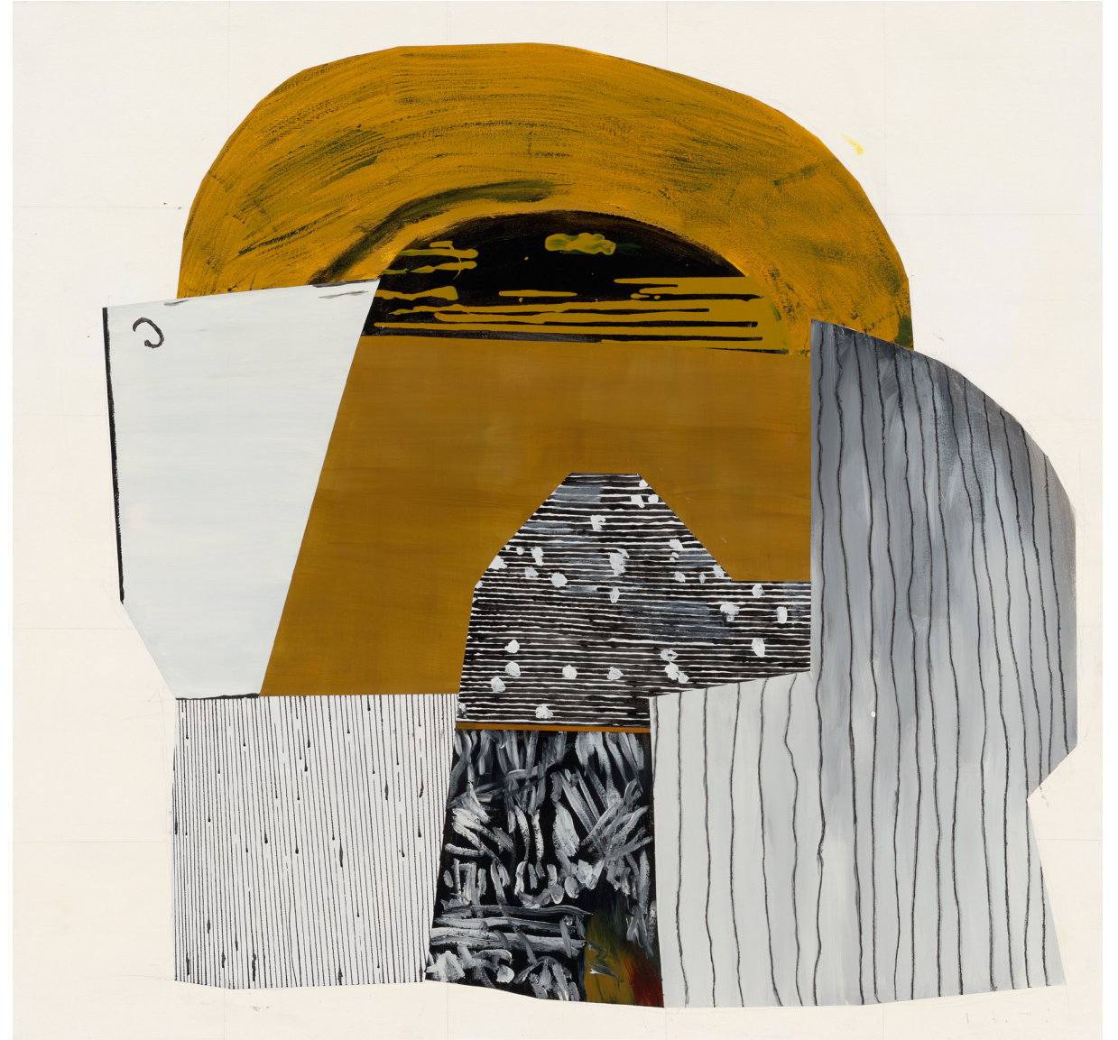
Cairn to mark unknown territory 2020 40 x 42 acrylic on wood panel