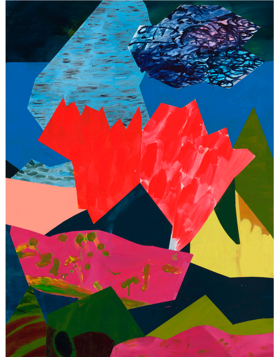
Cloak 2017 48 x 36 acrylic on wood panel